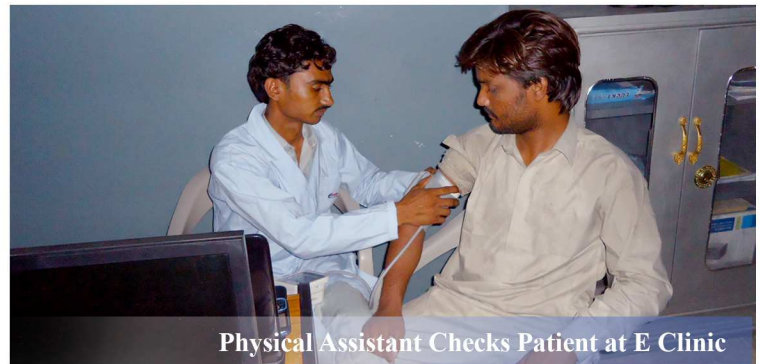
Physical Assistant Checks Patient at E Clinic

This project has been implemented in collaboration with USAID and ASK Development for rural communities of desert areas in Mithi District Tharparkar Sindh. E-clinic is