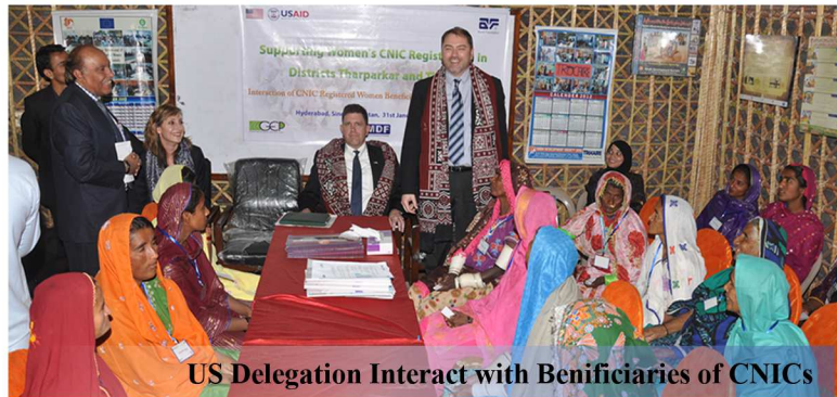
US Delegation Interact with Beneficiaries of CNICs

The project Supporting Women's Computerized National Identity Card (CNIC) Registration in Tharparkar District has successfully been completed by MDF in collaboration with Aurat Foundation and supported by USAID through NADRA in all 44 UCs of Tharparkar District of Sindh province.