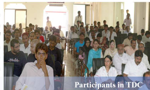
Participants in TDC

Maroo-ara Coordination Council in coordination with 18 partner organizations actively working in Sindh province organized Thar Development Conference on June 8-9, 2013 at Press Club Hall Mithi. The key objective of organising conference was to provide an opportunity to donor agencies, policy-makers, and other institutions to ponder upon lime-light scenario of Tharparkar and develop 5 years Development plan. In the conference around 195 male and female