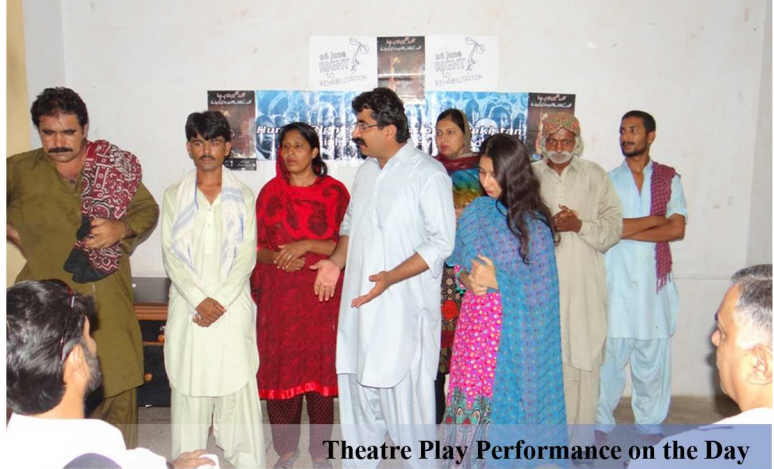
Theatre Play Performance on the Day

In 1997, the United Nations General Assembly decided to mark this historic date and designated 26 th June each year as International Day in Support of Victims of Torture. Right to Rehabilitation was the theme for 26th June, 2013 campaign. Human Rights Commission of Pakistan, Special Task Force Hyderabad organized a seminar on International Anti Torture Day on 26th June, 2013. The day was marked on to disseminate awareness to the civil society organizations, youth, social workers, media, intellectuals and stakeholders on serious issues to make the society free from torture.